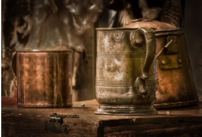
Morning Brew Lorell