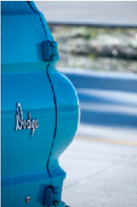
A100 badge Steve Folsom

For members that cannot attend a monthly meeting in person, you are encouraged to submit pictures. If you do submit photos please put a "Z" at the start of the file name.