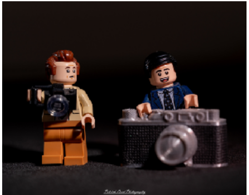
Camera Envy Pat Reed