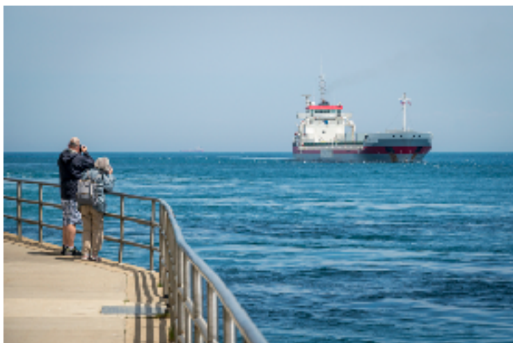
Boat Watchers Glen Suszko