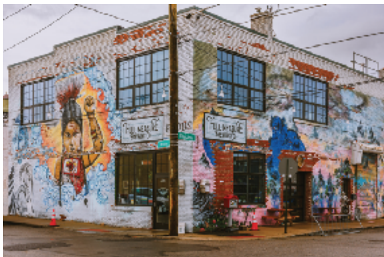
Eastern Market Chisako Thomas