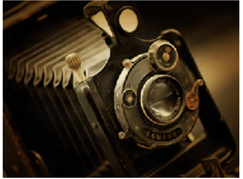
Manual Focus Lorell