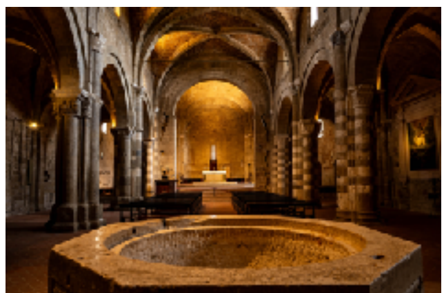
Sovana cathedral Steve Folsom