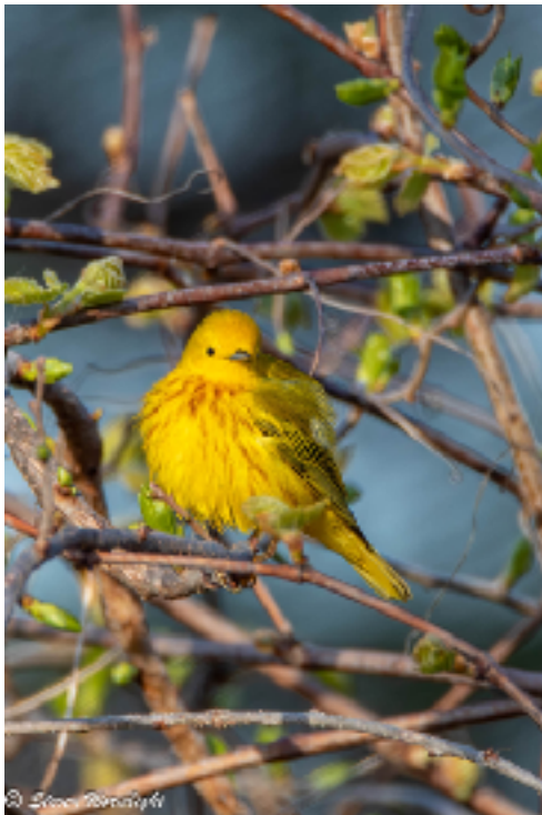
Northern Yellow Warbler Steve Wormlight