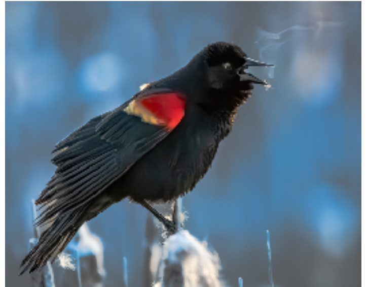
Breath Pete Drellick