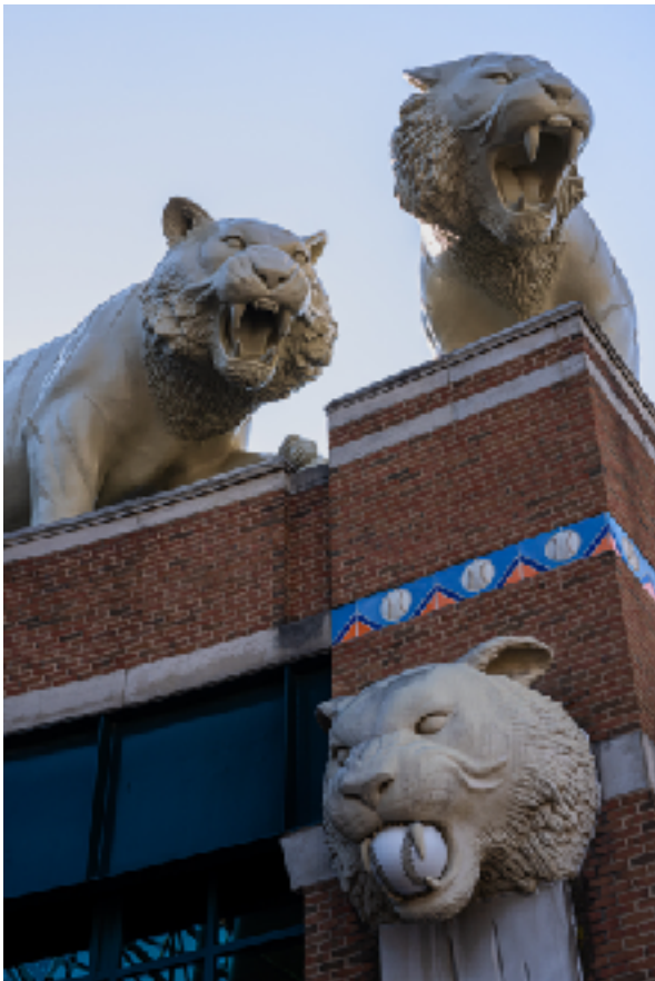
Detroit's Tigers - Jeff Bondono