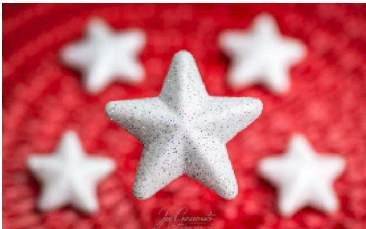
Five Joe Gazzarato