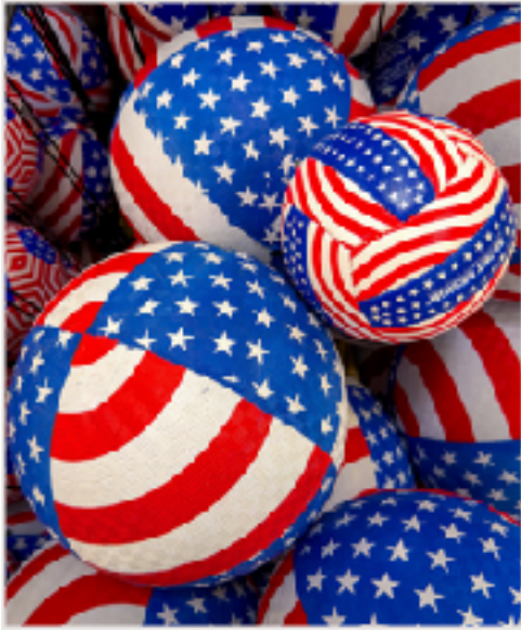
Red White and Blue Bill Buchanan